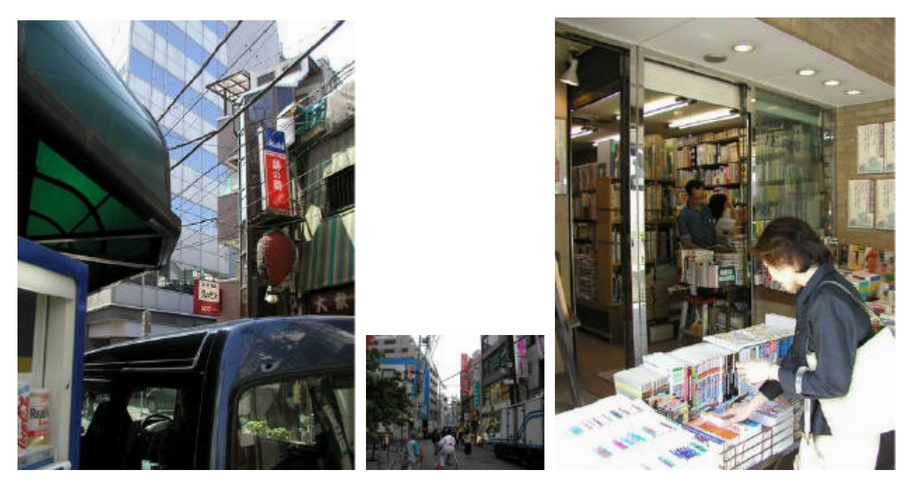
The book district... specifically used books. I've taken to wandering around here at lunch......

With a hot, but not overly hot, early afternoon sun beaming down, the sidewalk reminded me of nearly forgotten summers back during my childhood.