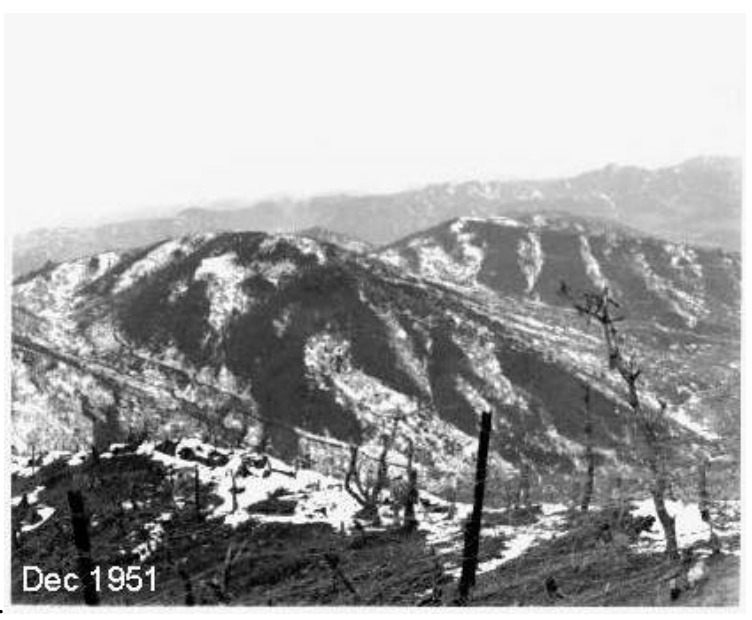
(Left) Sokkogae, North Korea, 20 miles north of the 38th Parallel on the Jamestown Line. Last tree standing on our hill, all others had been destroyed by artillery fire. Chinese positions in the background.

(Right) Korea This is "Baldy", just west of 3 Sisters (AKA Pork Chop Hill). It was used by the Chinese to direct artillery fire against our forward positions and so named because all the foliage was blasted away during the struggle for the high ground.