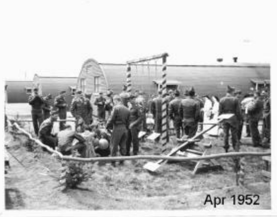
(Left) Quonset huts the 8th Cavalry used at Chitose, Hokkaido, 1952.

(Right) Playground built by the 8th Cavalry Regiment at Camp Chitose, Hokkaido for children residing at a nearby Catholic orphanage. As a result of the Occupation, most children had American fathers and Japanese mothers. The Sisters and children were invited often for lunch, usually on Sundays. Soldiers of the regiment loved the kids and contributed time and money for their welfare.