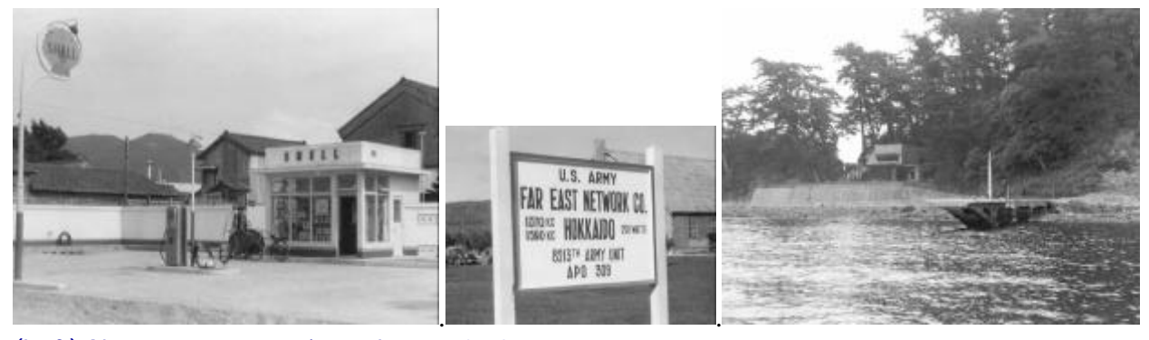
(Left) Numazu gas station - June 1953

(MIddle) Camp Crawford near Sapporo - October 1953