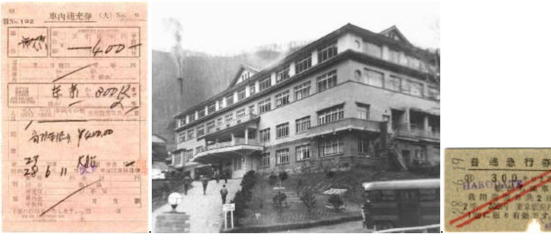
Hotel in Norboribetsu, Hokkaido. I stayed here in 1952 and 1953. Great hot springs.