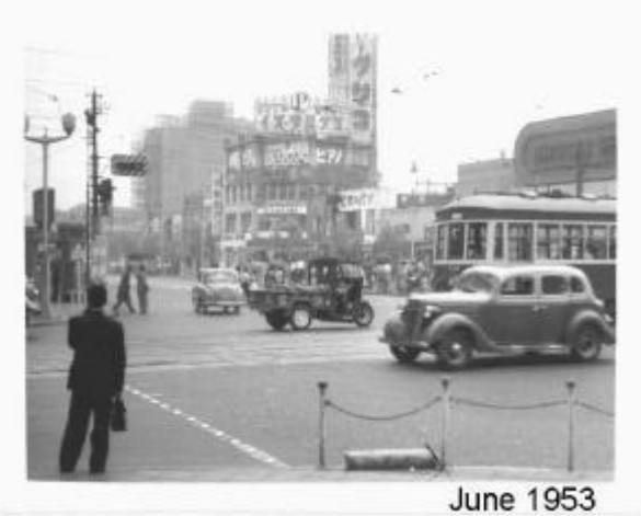
Ginza, Tokyo - 1953