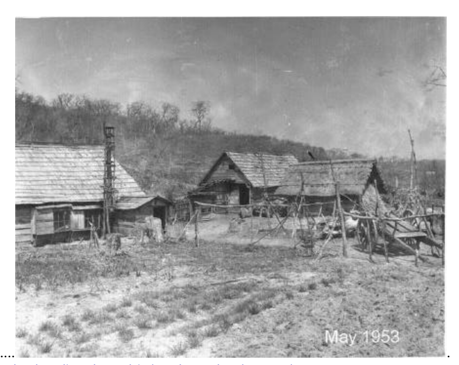
The people that lived on this land made charcoal.