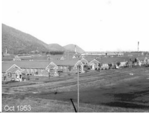
(Left) A Numazu hotel for American military personnel during the occupation. Close to Suragu Bay with a view of Mt. Fuji. I stayed here twice, in 1952 and 1953.

(Right) K (King) Company area, Camp Crawford near Sapporo, Hokkaido. The 8th Cavalry Regiment occupied the post when it returned from Korea a second time in December 1952. I lived in the 3rd barracks from the left, Headquarters platoon, the so called brains of the company. As you can see, the barracks here are nicer than the Quonset huts we had at Chitose. I called this home from December 1952 until I left in October 1953.