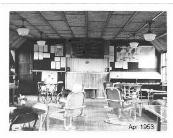
(Left) Sapporo - April 1953

(Right) This photo might not interest you but to me it brings back fond memories. It is the Company K Day Room at Camp Crawford, Sapporo, Hokkaido. I enjoyed playing ping-pong with the Japanese tailor who had a work shop behind the door in the left rear. My mail office was in the right rear and I sold snacks and soda for the Company Fund through a opening in the center. As mail clerk, I was in charge of the room, responsible for its cleanliness but exempt from all other duties. I spent many happy hours here playing cards, talking and just hanging out with the men of Company K.