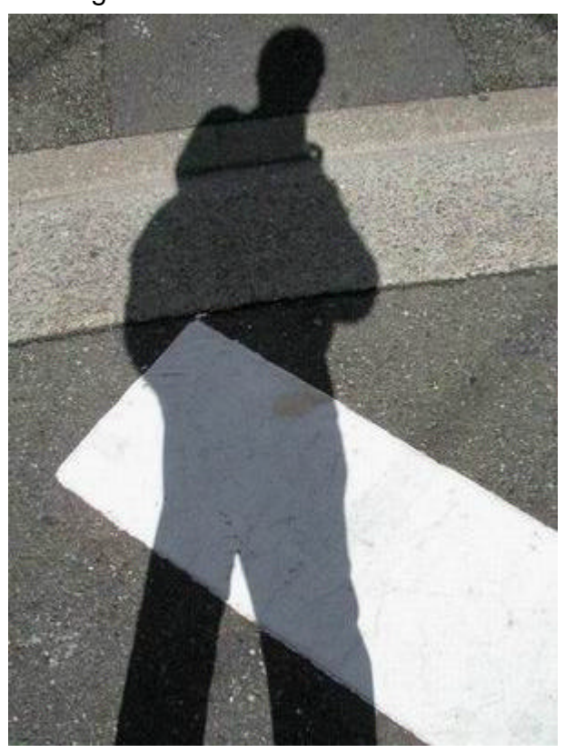
A too uncommon scene... not far from my office though.