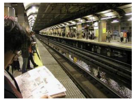
The first two photos here were on the same walk to Shinjuku Station as the golden-lighted photo in the first row. The manga reader is at Ebisu Station.