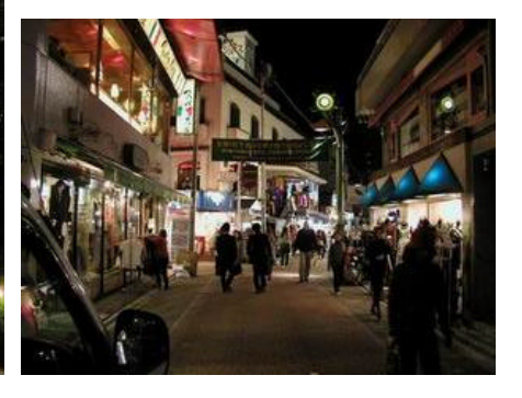
Typical night views in Tokyo – the rushing blur of late night train travel; the electric blue-gray sky that knows no darkness; people everywhere wandering around in the labyrinth of the city (Harajuku in this case).