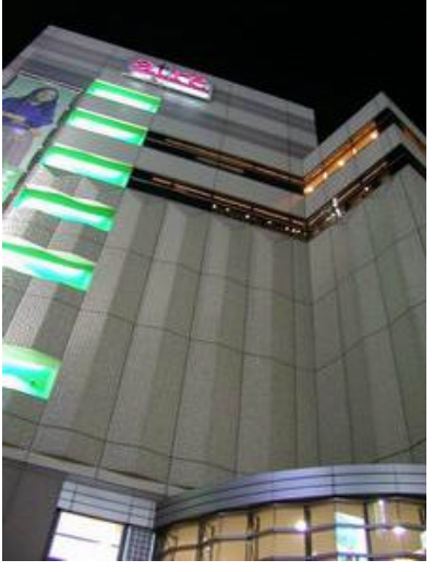
Looking up in Ebisu