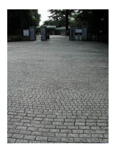
Green and blue... and the gray of stone. I thirst for blue and green like a man in a desert......