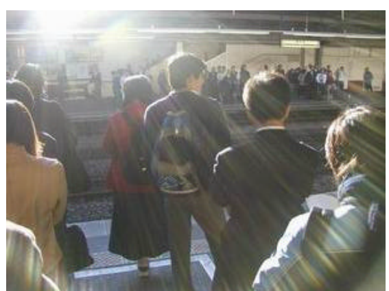
The morning sun in Shin-Akitsu