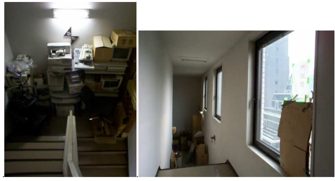
Left side - the "storage room" in the emergency stairwell. Most of the equipment pilled up there is just junk, although there are a couple of viable computers in the mess. On the right..... the sign I'm writing about in LL-293. (I tore it down today so I could open the window......)