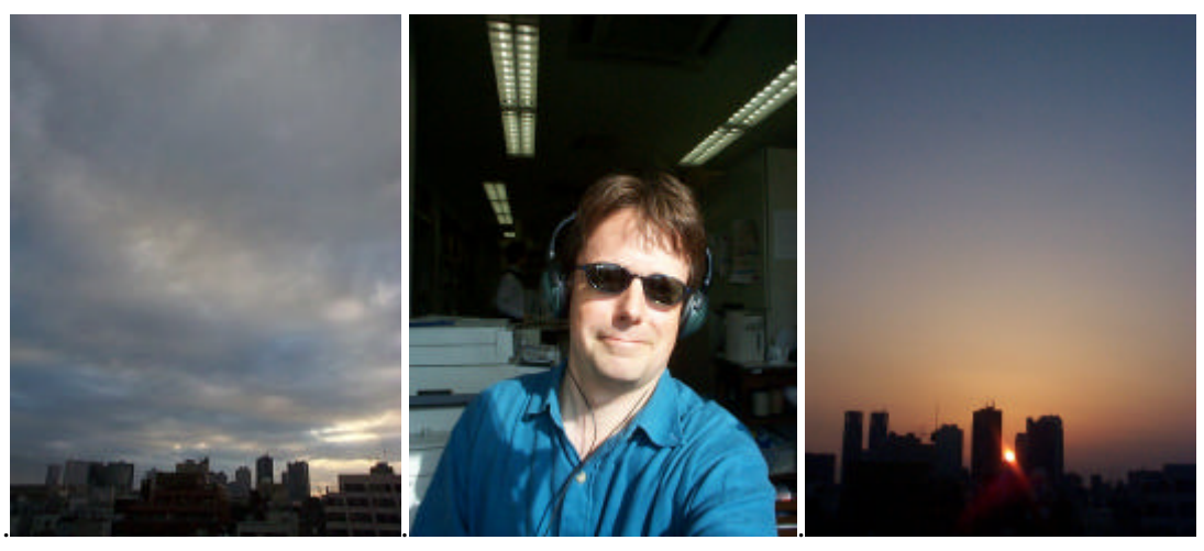
Looking happy and actually feeling good from time to time - with some good sunset scenes. The left side photo I took because of the dramatic clouds - and the right side one (taken today) I took because the sun was precisely between two high rise buildings... Notice how sloppy I look.. I've given up trying to look business-like, so now I just put on the headphones and tune the office out as much as possible while I'm working on something.